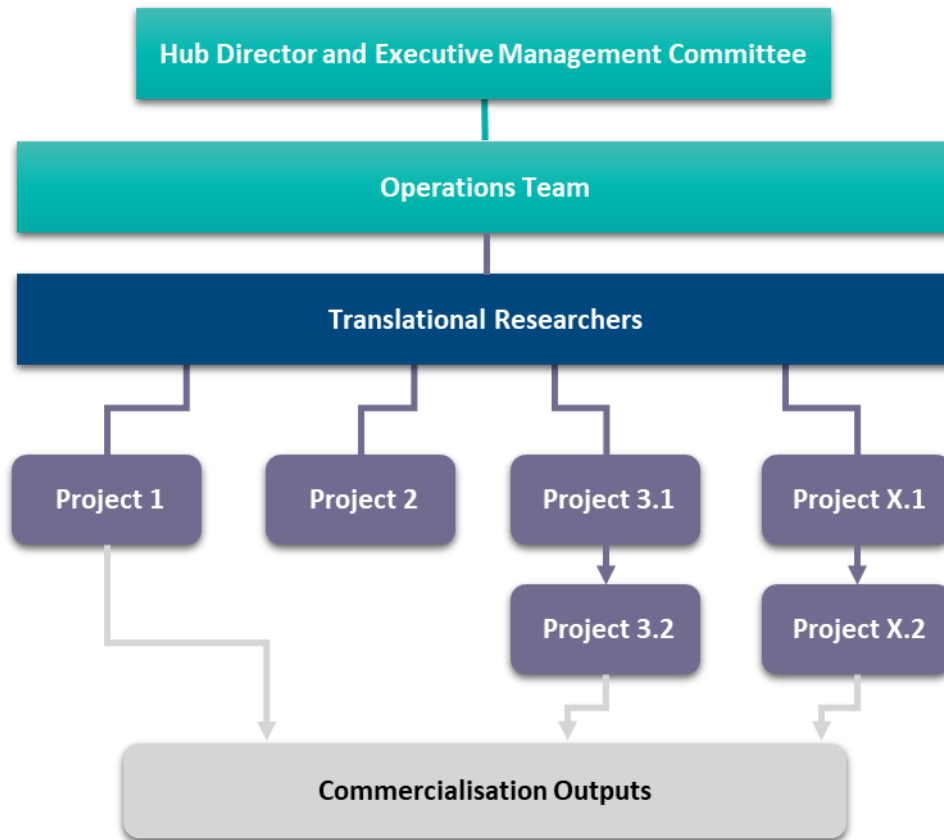
Figure 2: Hub Structure